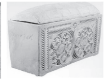
(Identify picture above)