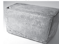
(Identify picture above)