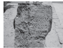
(Identify picture above)

...[F]or these stories to be legends, the rate of legendary accumulation would have to be "unbelievable"; more generations are needed... [E]ven the span of two generations is too short to allow legendary tendencies to wipe out the hard core of historical fact (A.N. Sherwin-White, Roman Society and Roman Law in the New Testament , p. 190).