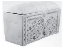
(Identify picture above)