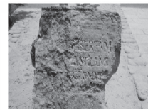
(Identify picture above)