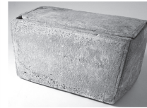
(Identify picture above)